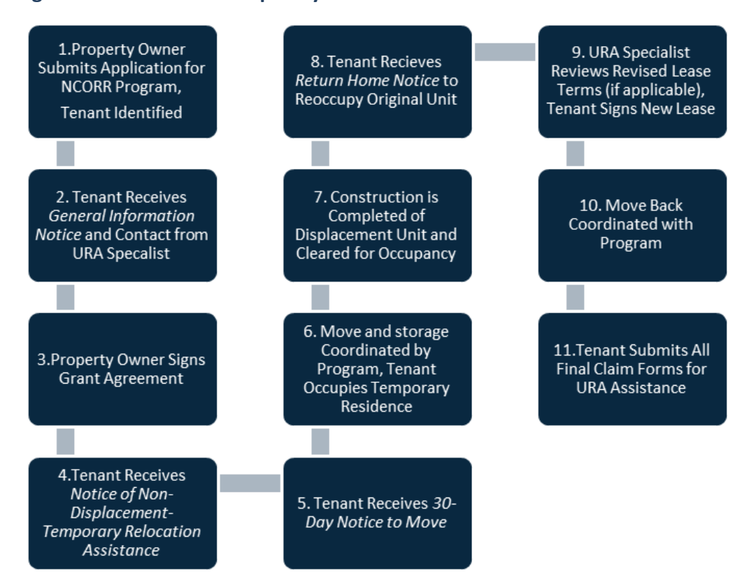
Figure 4: Overview of Temporary Location Process

Eligible tenants residing in properties participating in HRP that involve reconstruction, replacement or rehabilitation (including elevation) will receive temporary relocation assistance if they must move temporarily (less than 12 months). In these cases, program activities will be planned and carried out in a manner that minimizes any hardships for households residing in storm-damaged properties.